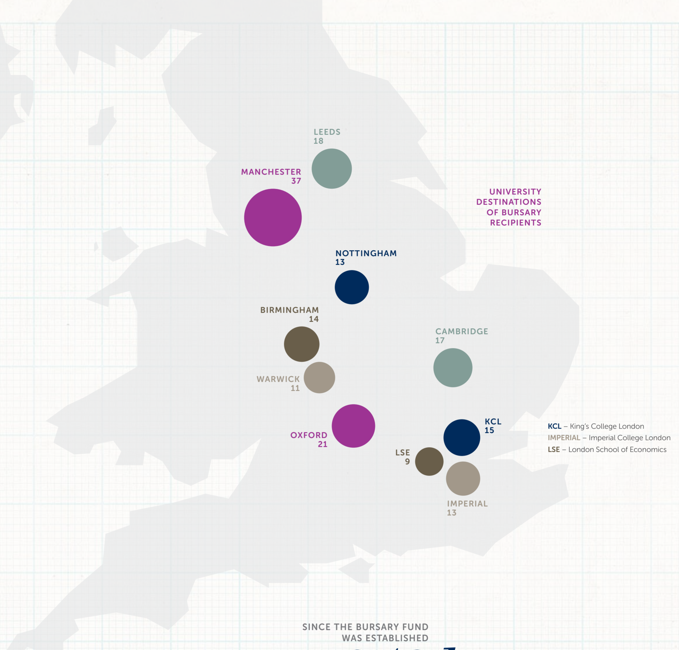
UNIVERSITY DESTINATIONS OF BURSARY RECIPIENTS

KCL – King's College London IMPERIAL – Imperial College London LSE – London School of Economics