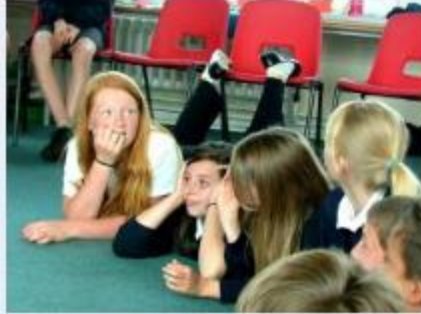
Partnership Visit Fund