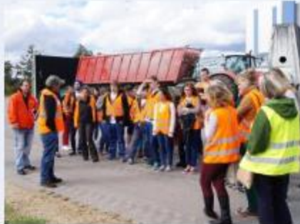
Challenge Fund - World of Work