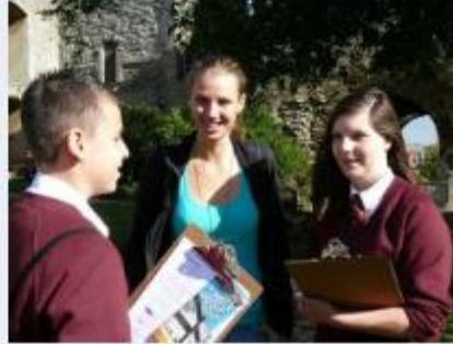
Flexible funding scheme