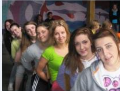
Youth Challenge Fund