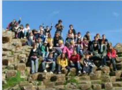
Partnerships in Learning